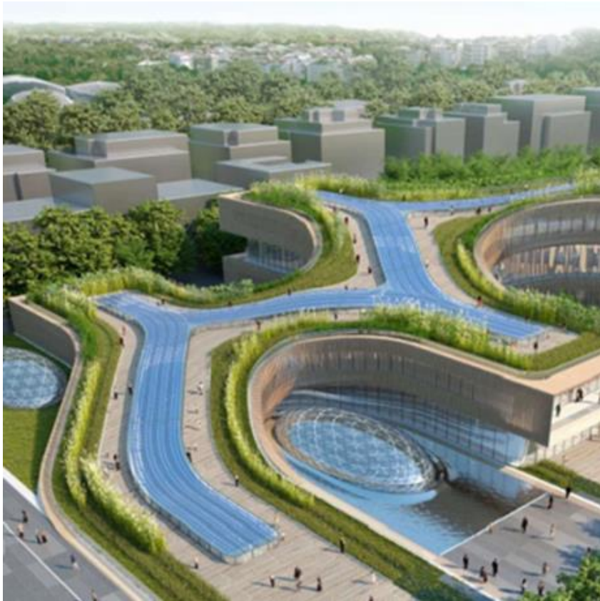
National Urban Observatory