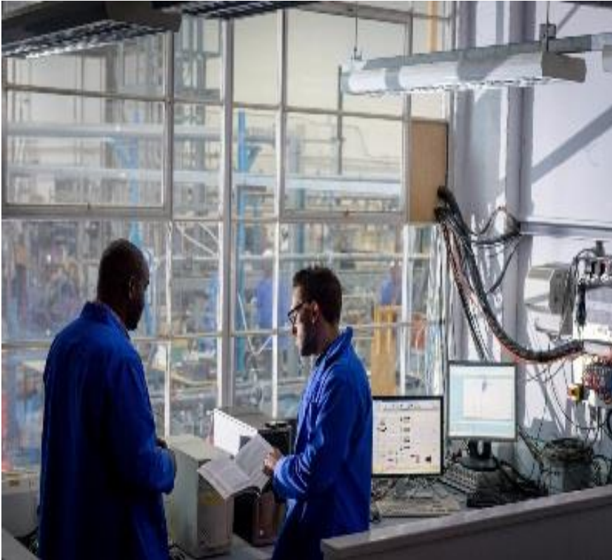
Process Systems Engineering Laboratory