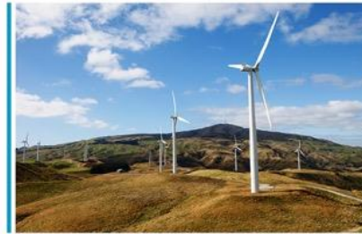
Energy and Power