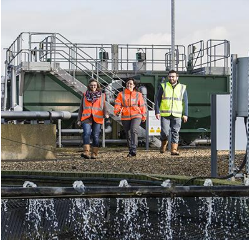
Pilot plant hall facility