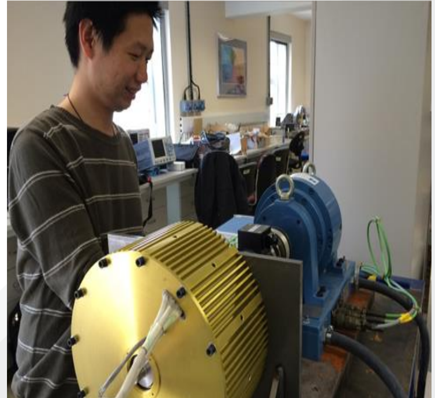
Electrical machine test and validation