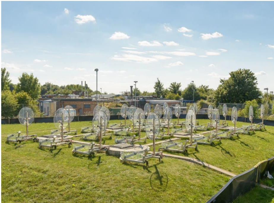
Wolfson field laboratory