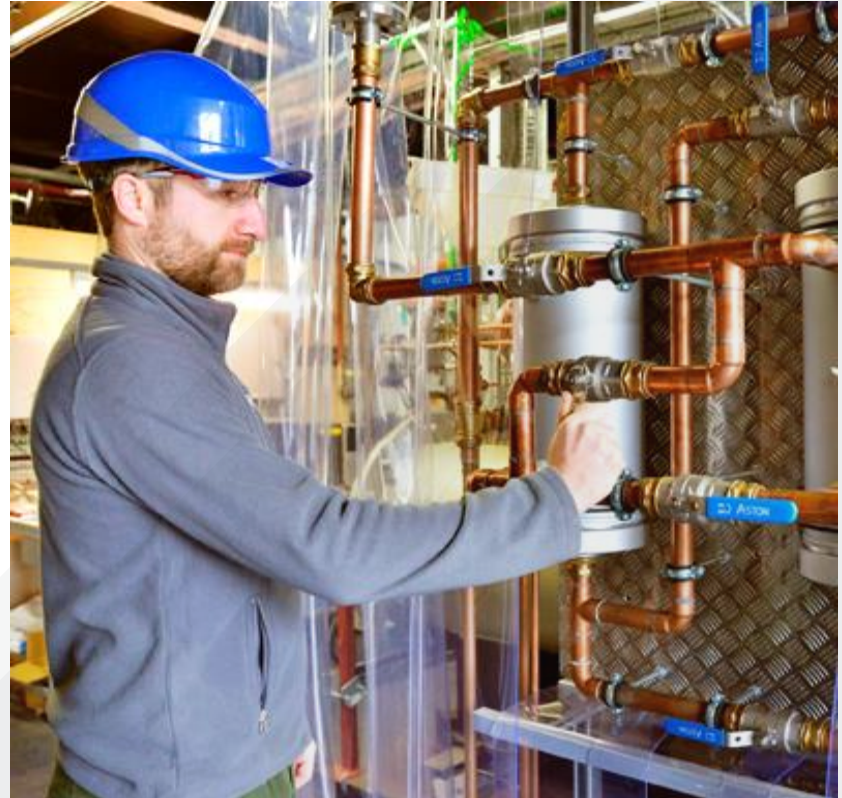
Energy technology laboratory