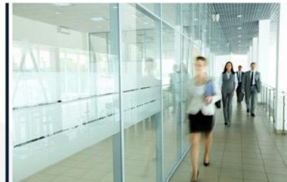
School of Management