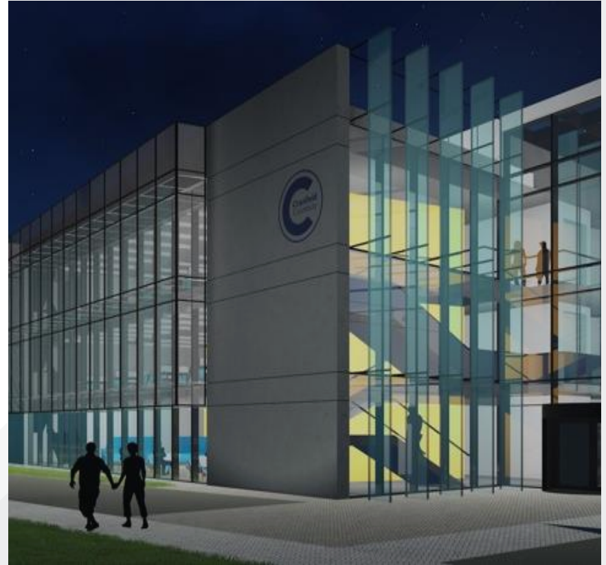
Point-of-use water treatment development laboratory