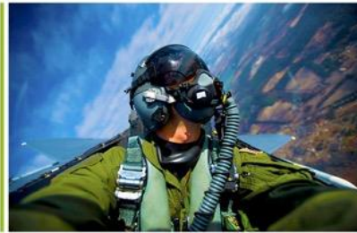
Defence and Security