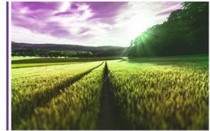
Environment and Agrifood