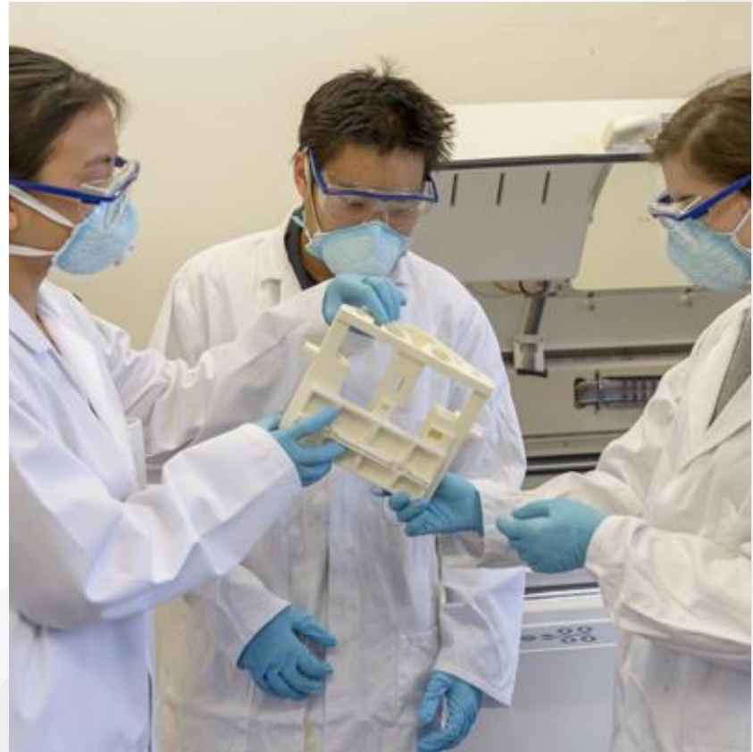
Water Science Institute