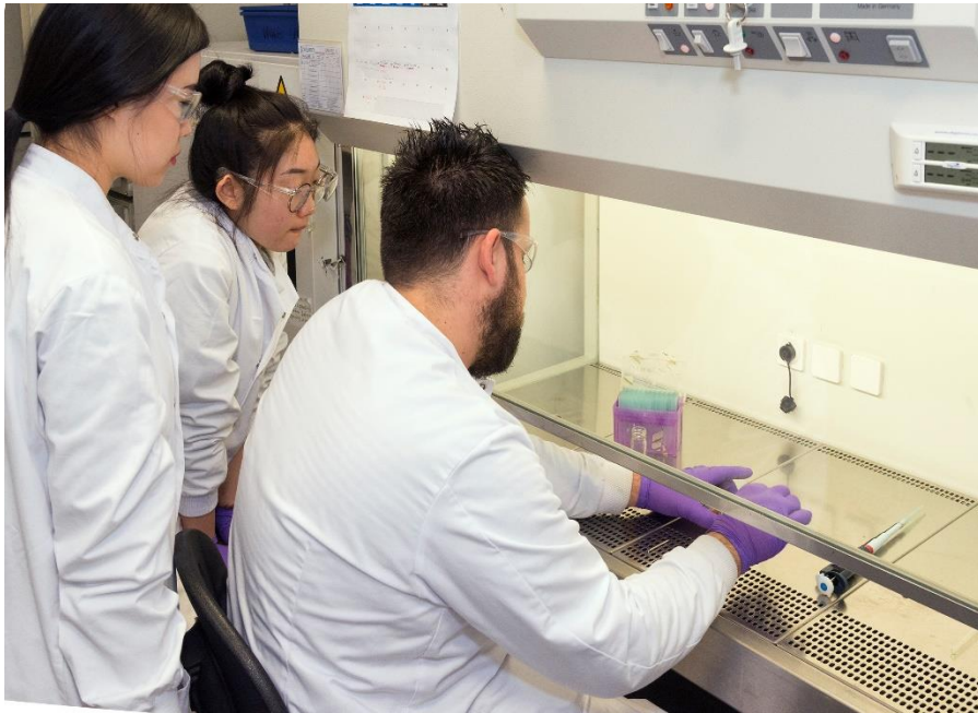
Environmental analytical facility