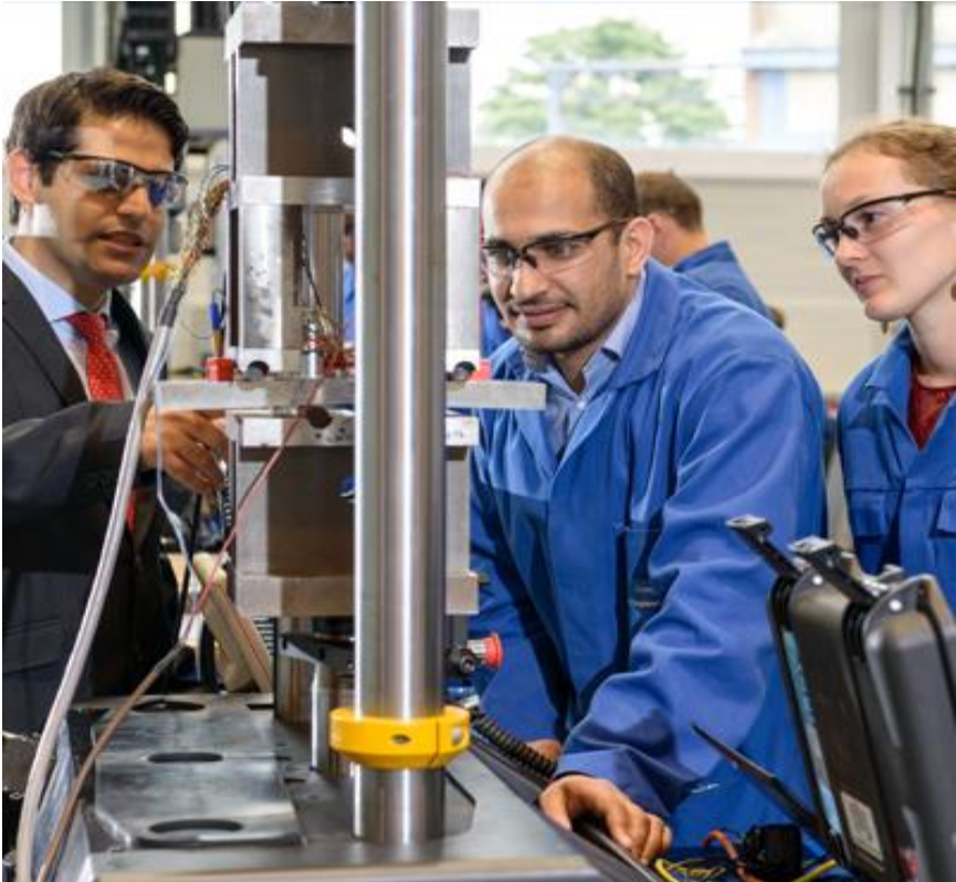
Structural integrity laboratory