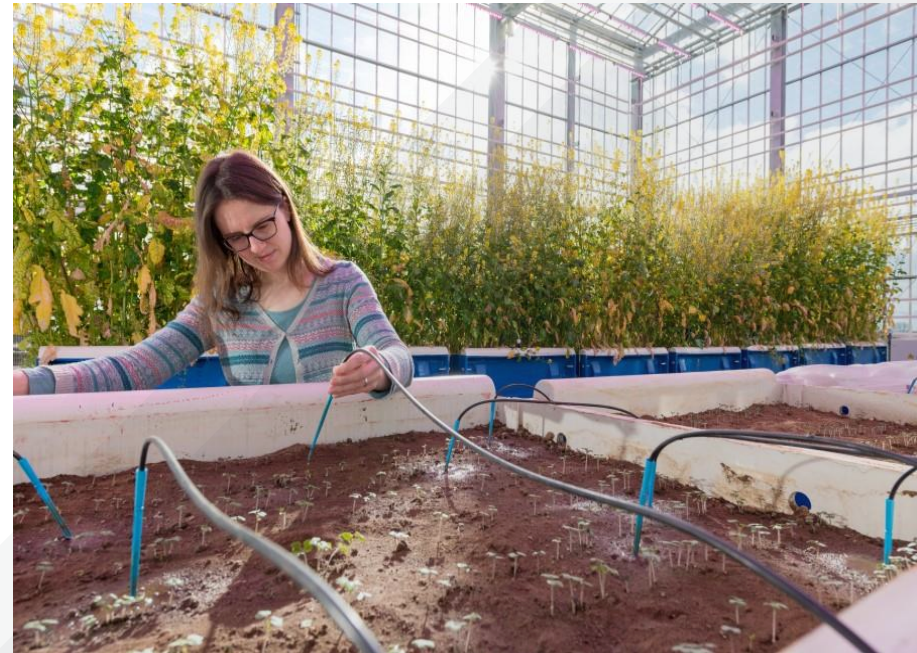
Plant growth facility